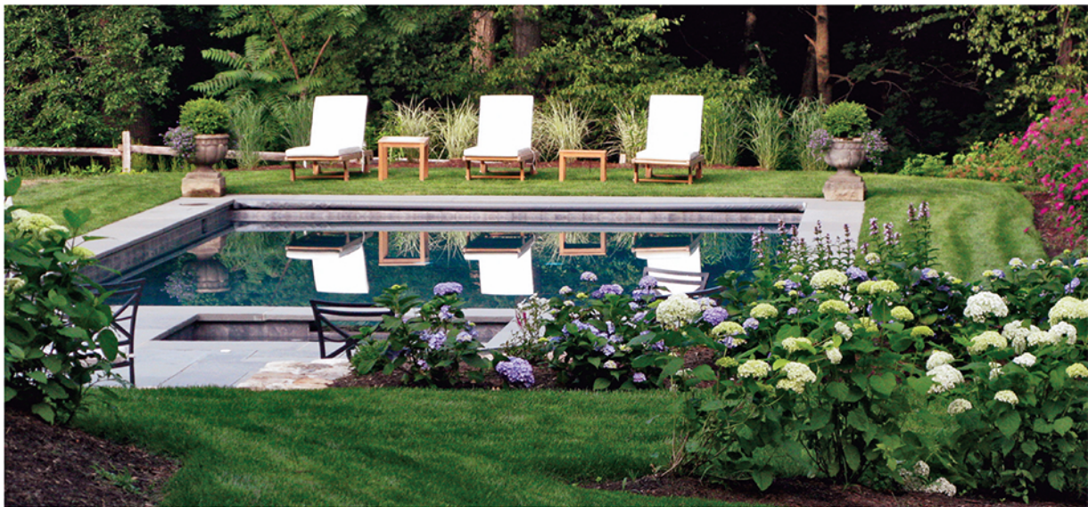
Garden design and photos by Eva Chiamulera

The pool has a wide 2' bluestone coping for a finishing edge, with grass on three sides for a soft, cool carpet all around.